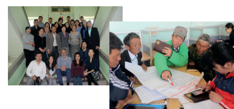
Mongolia: The first ToT was held in May 2016 with over 26 participants from herder cooperative organizations. Two newly-qualified trainers implemented a field training for 20 cooperative leaders of selected herders' cooperatives