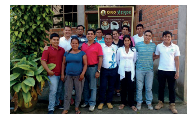
San Martin, Peru: For the first time since it was launched in 2012, the My.Coop – Managing your agricultural cooperative training package was adapted at the provincial level in the San Martin region of Peru for use by coffee and cacao farmers. Validation workshop was held in July 2017 by the Cooperativa Agraria Cafetalera Oro Verde.